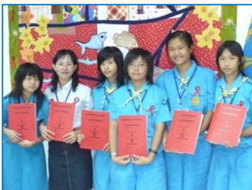
Girl Scouts and Leader with AIDS quilt

Girl Scouts of Taiwan held an adolescent HIV and AIDS curriculum event on 15 September. The event was based on the WAGGGS adolescent health message "fight AIDS". To increase understanding both on HIV and AIDS and drugs abuse, speakers and experts are working in the field of anti-drug and HIV and AIDS prevention were invited to the sessions to share their experiences. Events have been held in cooperation with the Centres of Disease Control of government in each district for many years with the target to advocate the AIDS treatment, prevention and the human rights of HIV and AIDS infectors.